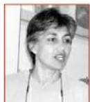
SABIHA MUJTABA: 076501 Beadlock kit Complete

These are (See our Website for current offerings) a great way to improve your skill set and to expand your knowledge of woodworking. If you are not sure you'll like a certain type of woodworking, come to Atlanta and take a class to check it out.