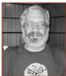
BOB SAYE: 25-869 Delta Magnetic Work Light

Fast cutting and long lasting. High octane cutting discs for your random orbit sander.