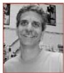
ED SCENT: 124041 K3 Kreg Jig Master System

Brings meaning and purpose to the lives of airport security staff and solves problems with pesky neighbors.