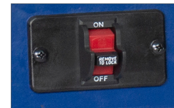
ON/OFF SWITCH WITH SAFETY KEY

To find a dealer or products questions call (877) 884-5167 or visit RIKONTOOLS.COM