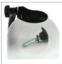
2.5X MAGNIFYING EYE SHIELDS